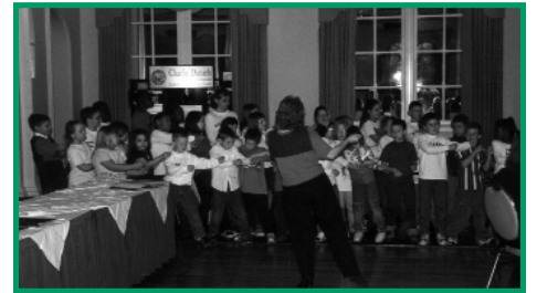
The A+ Afterschool Choir from Gardner Math, Science, and Technology Magnet School entertains the crowd at the closing luncheon of the conference.