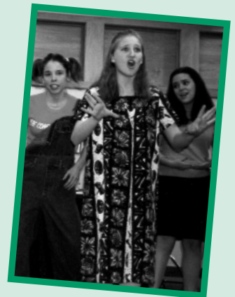
The Southside Theatre of Southside High School in Fort Smith gives a wonderful performance of "Clean Getaway," a production that teaches the benefits and importance of reducing, recycling and reusing.