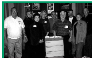
Winners of the "Come Clean" contest claim their prize, a case of Gain® laundry detergent.