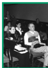
Various speakers present valuable information on litter prevention, beautification and recycling in 17 information-packed concurrent workshops.